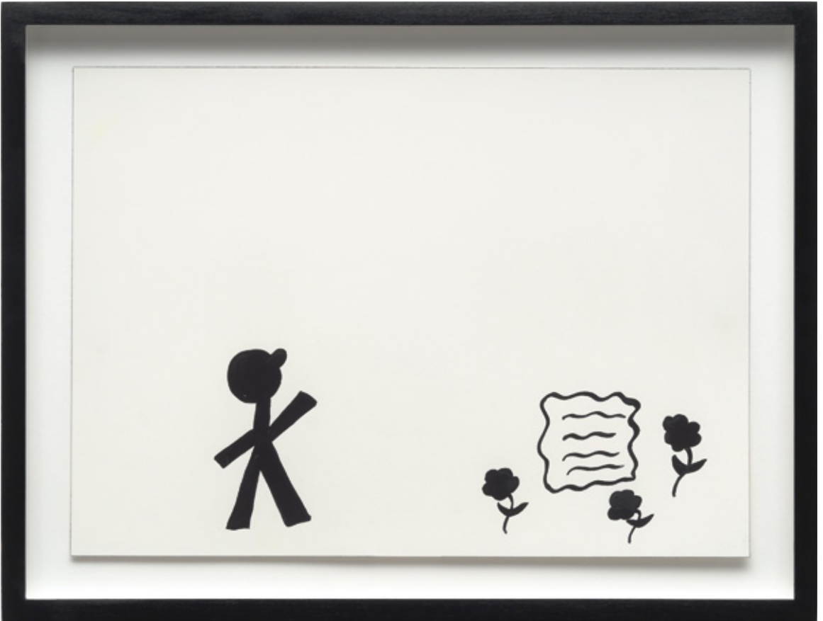
Kalup Linzy, Conversations wit de Churen VII: L'il Myron's Trade , 2009. Digital video on DVD, 9 min. 49 sec. Courtesy of Kalup Linzy

satirized black women through Geraldine, his own persona was separate. Ditto the late Red Foxx and Tyler Perry, who used black culture as a basis for satire on TV and in film. However, Linzy is not afraid to reveal himself through his characters: it is not simply a satire of Lucretia but of Linzy himself in drag. Linzy's art is not like a TV show or a movie; rather, it bridges a gap between imagery of popular culture and imagery of art, a seamless relationship between made-for-TV and performance art. His art also breaks down the barrier between an artistically informed eye and the perception of the non-art-conscious person on the street. His work not only brings black pop culture to performance art, it brings new audiences as well. Yet, as his art entertains, it also disturbs. At the center of our discomfiture may be the disorientation resulting from his cross-dressing: we enjoy the voyeuristic experience it provides, but we are uncertain of the persona and sexuality it reveals and challenges us to examine ourselves.