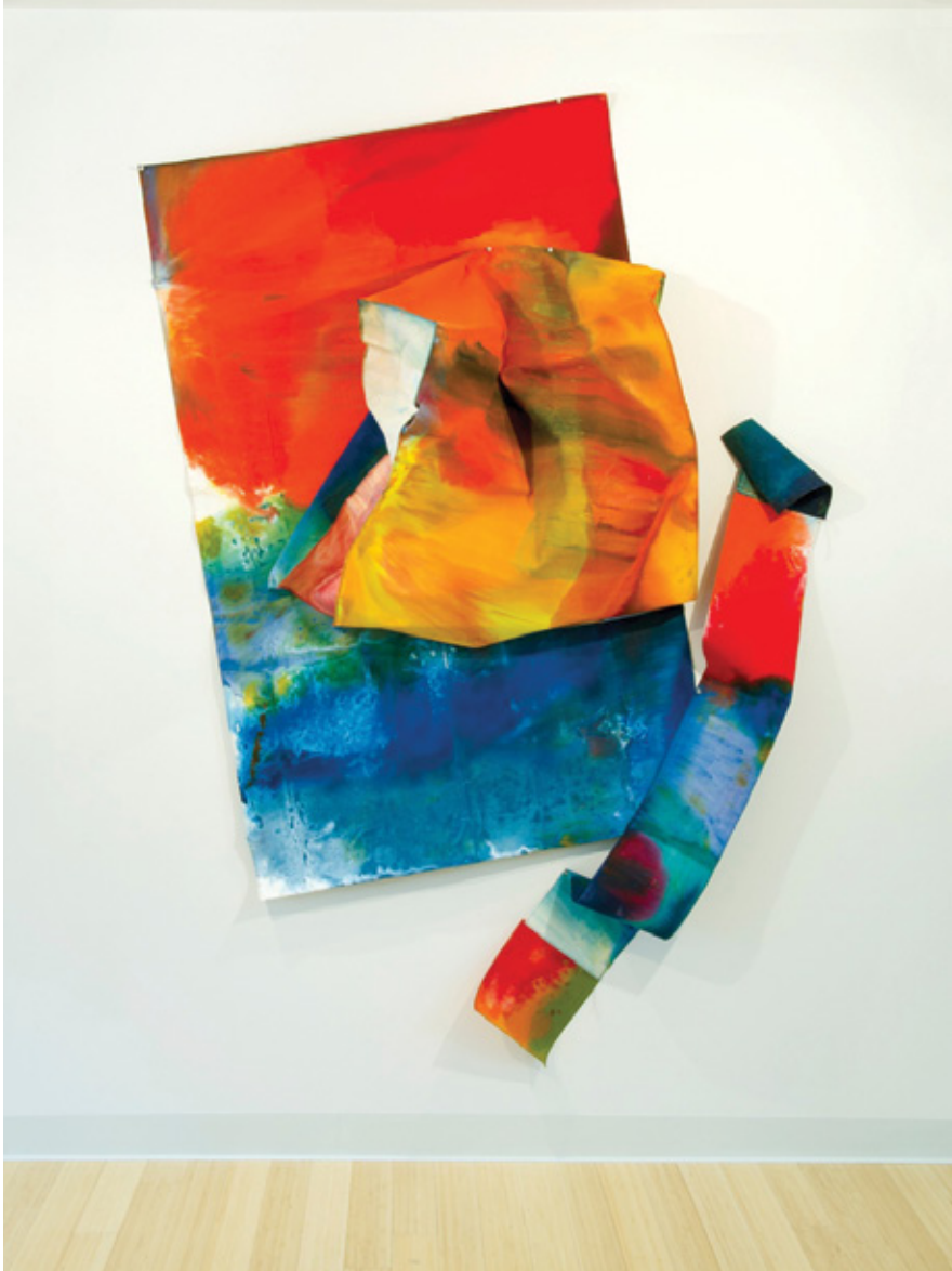
Sam Gilliam David , 2011. Mixed media, 89 x 67 x 17. Courtesy of Sam Gilliam

SAM GILLIAM is one of the most important painters of the twentieth century, having burst on the scene of American art in the early 1960s. His landmark paintings float the canvas from the stretcher, making color and form ethereal. Over the years he has expanded that concept by giving pigment visceral solidity and blurring the lines between painting and sculpture; adding collage elements in ways that change the concept of space; charging colors with scintillating light so that they seem to be a chimera; raking and building paintings from the floor; making architectural structures and environments; and exploring forms that move