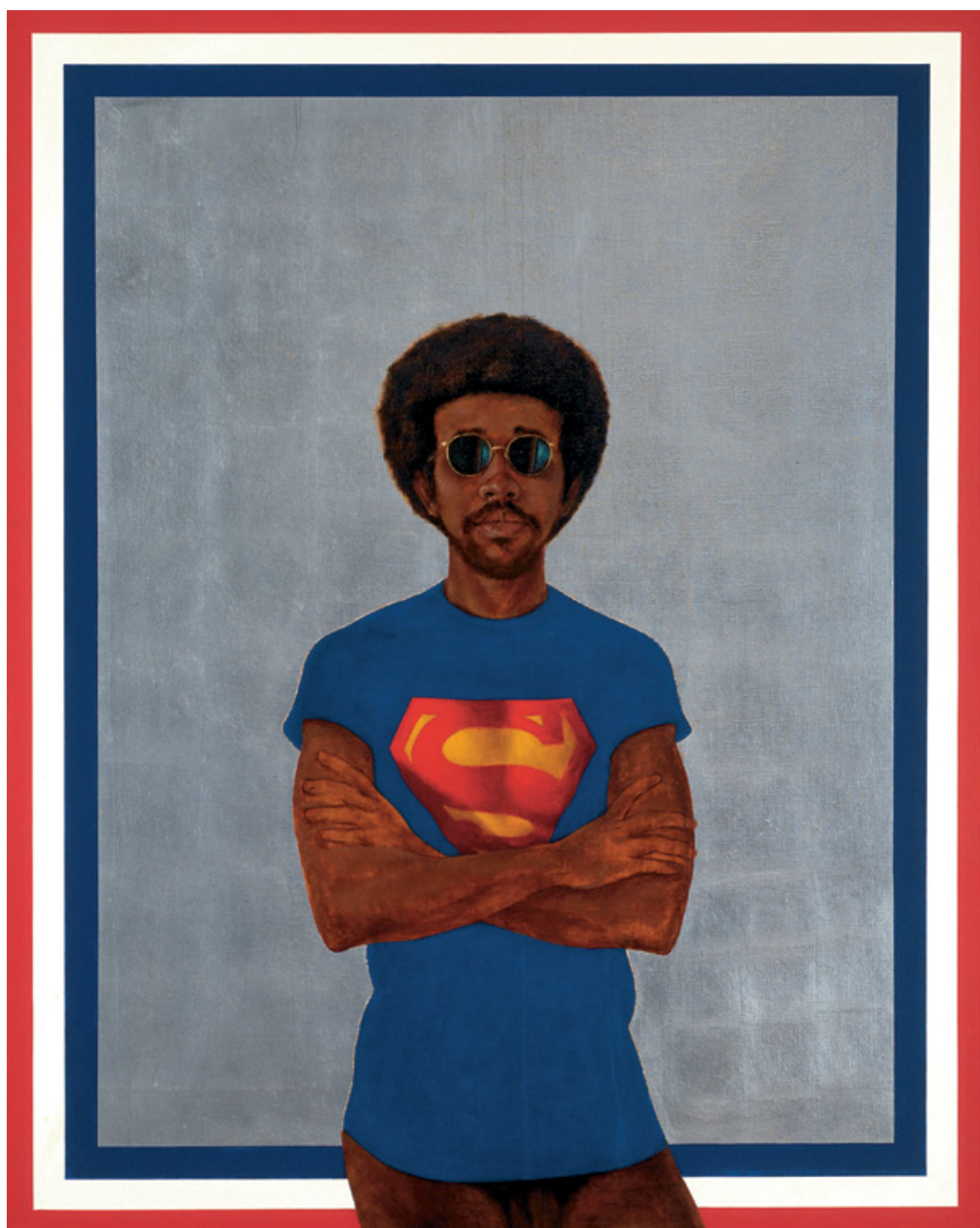
Barkley L. Hendricks, My Man Superman (Superman Never Saved Any Black People—Bobby Seale) , 1969. Oil, acrylic, and aluminum leaf on linen canvas, 59 1/2 x 48.