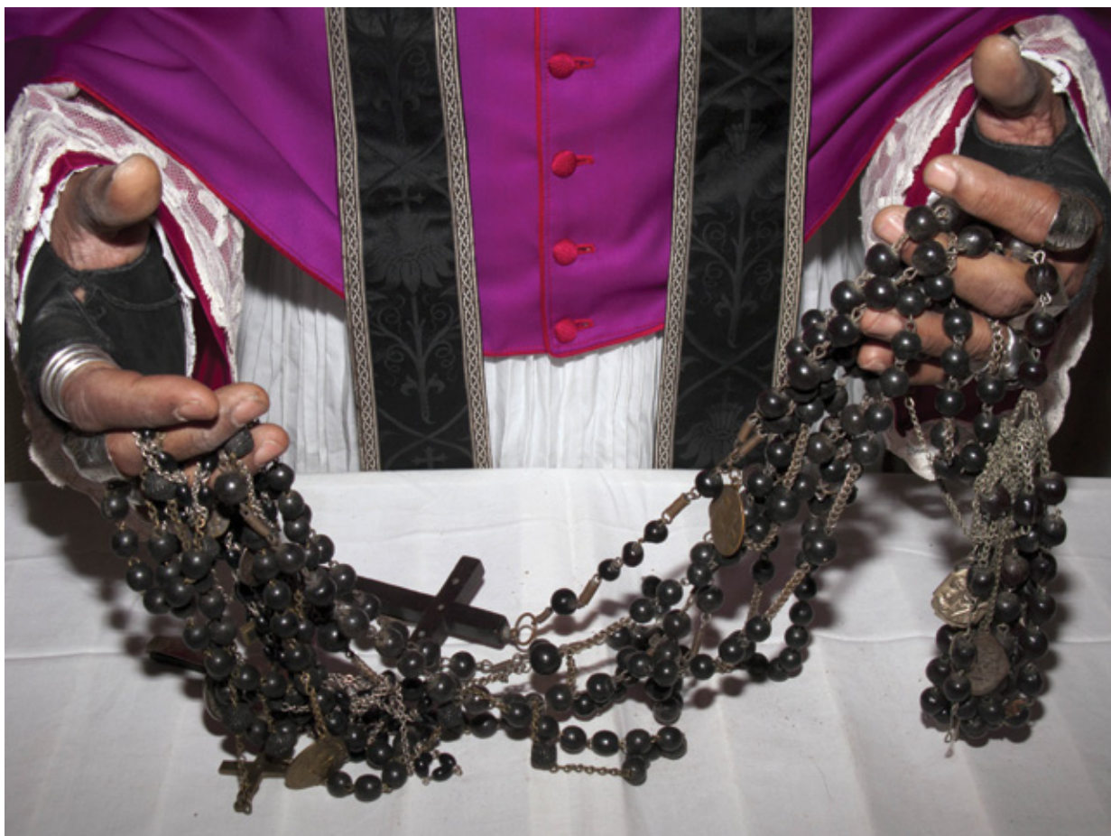
Terry Adkins, Bishop , 2011. 4 photographs as a set of one, 24 x 36

TERRY ADKINS, activist, artist, commentator, musician, and poet, has been working in a variety of art media for more than twenty years. Adkins is like a shaman, playing formal and improvised instruments in ways that mesmerize, dramatize, and ultimately express imagery about the African American/African spirit. His work includes installation concepts with sculpture, performance, photography, poetry, and, as noted, music. Often his work is collaborative; he joins with other artists to create and perform ritualistic and ceremonial environments. His art seeks to immortalize cultural icons and to replay historic occasions and associations, especially about the African American past. His mission: to elevate or restore significant cultural and political icons who have affected the African American legacy to their rightful place in history.