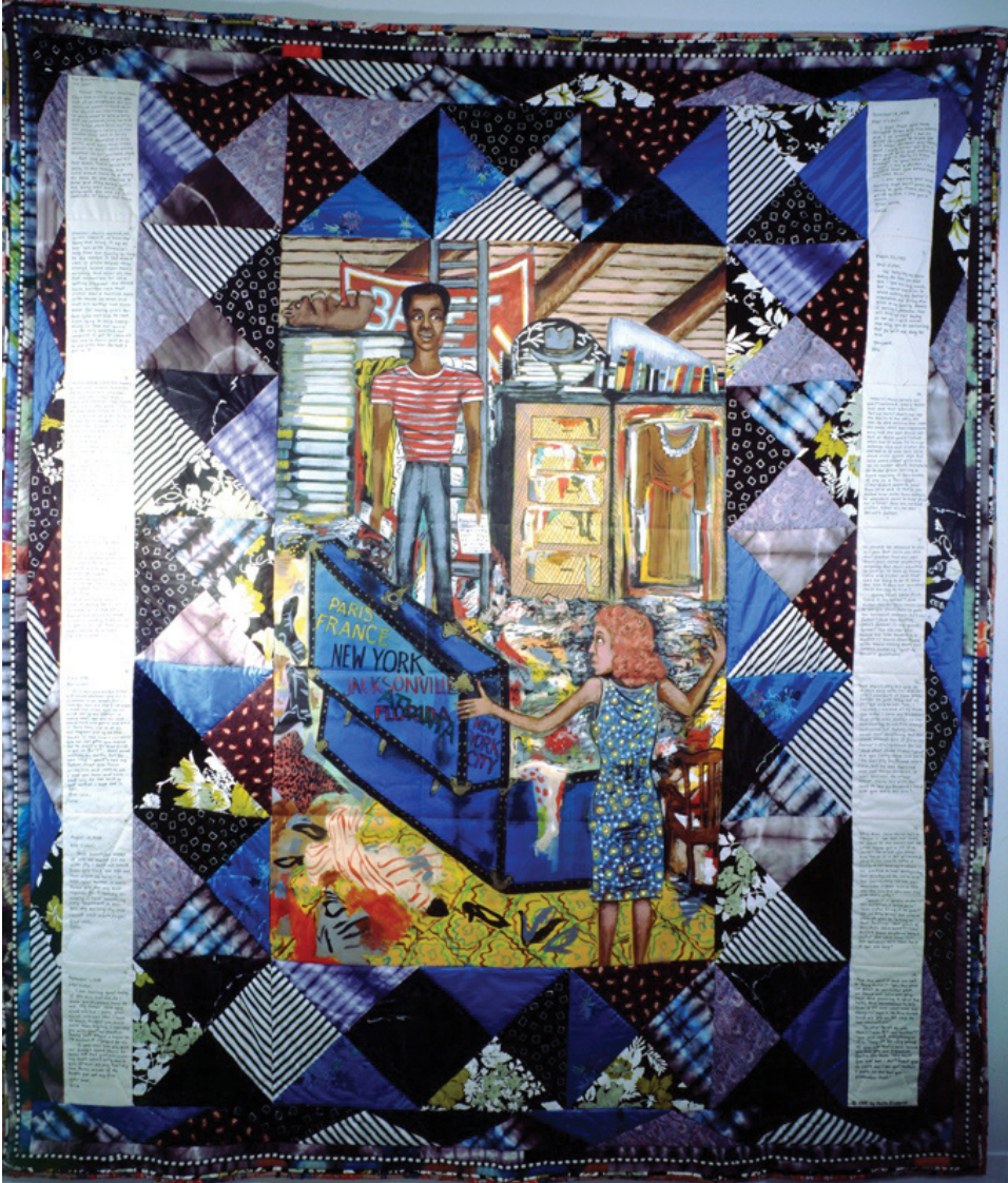
Faith Ringgold, The Bitter Nest IV: The Letter , 1988. Acrylic on canvas, printed, tie-dyed and pieced fabric, 94 1/2 x 84 1/2. Courtesy of the Artist and ACA Galleries, New York, NY

FAITH RINGGOLD began her artistic career as a painter more than fifty years ago and is now one of America's most renowned artists. Over that time she has done paintings about her life experiences, travels, the civil rights movement, and a great variety of other topics of our time. In addition, Ringgold has been a forceful voice for feminism over the last four decades. Her American People paintings (1963–67) and Black Light series (begun in 1967) sought to examine how traditional color values could be modified for black subjects. From there she explored traditions of “women’s work” in fabric, first in collaboration with her late mother and then in her Story Quilts , which have become her signature statement.