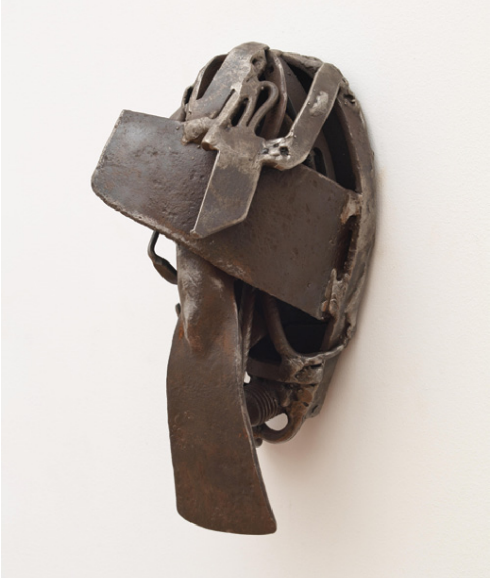
Melvin Edwards, Bara Niasse Tugge, 2008. Welded steel, 14 1/2 x 6 1/2 x 6 3/4.

by the artist, with varying periods of intensity, since 1963. There are now more than two hundred pieces in the series. These sculptures, most about a foot tall, are meant to be hung on the wall at eye level. The essence of these works lies in the transformation to which Edwards subjects the objects he finds to use in these sculptures. The objects are so radically changed that they are perceived as abstractions that belie the state in which he found them, all the while retaining the aura of their origin as utilitarian objects and the spirit of historic brutality for which they were used. Edwards forges, welds, bends, and stretches the metal objects in these works—hammer heads, scissors, locks, chains, and railroad splices—and transforms them into a new kind of sculpture.